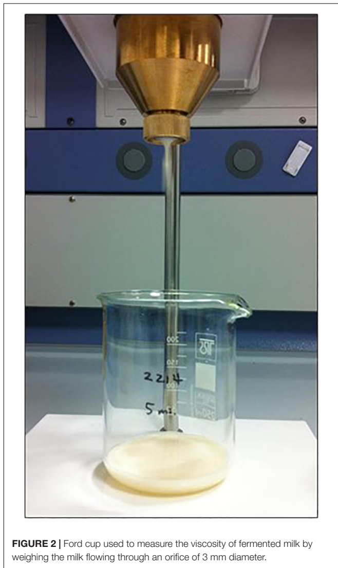
FIGURE 2 | Ford cup used to measure the viscosity of fermented milk by weighing the milk flowing through an orifice of 3 mm diameter.

At the end of SSM fermentation (pH 4.5), it was possible to observe differences in the appearance of milks fermented by the EPS+ strains. W4451 produced a more compact and uniform clot, similarly to Ldb2214 . Differently, Ldb147 produced a grainier and looser clot similarly to EPS– strain L220 (data not shown). The different appearance of the clots may be related to the different EPS composition, as previously observed (Vincent et al., 2001).