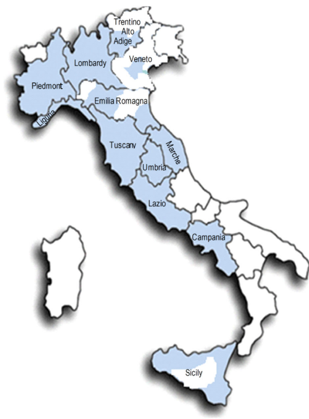
Figure 1 Italian geographical areas (regions) included in the study.

All statistical analyses were performed using Stata, release 13.0 (Stata Corporation, College Station, TX, USA).