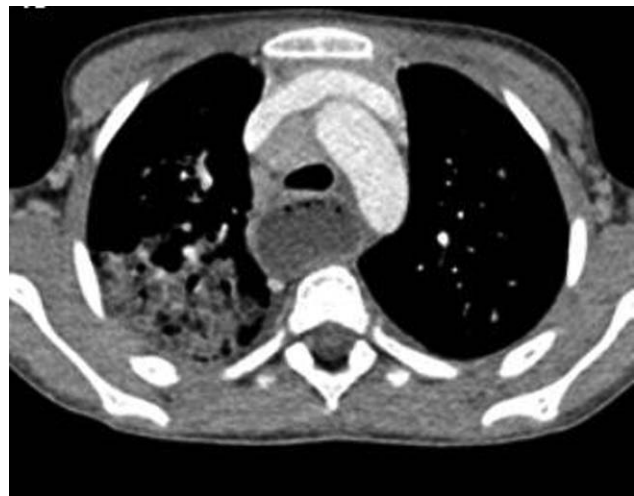
Figure 1. Chest computed tomography scan showing right parenchymal lobar pneumonia associated with air bronchogram, diffuse “ground glass” images, multiple mediastinal enlarged lymph nodes, and a dilated esophagus filled with solid material.

After a detailed history-taking, the parents reported progressive dysphagia, failure to thrive, weight loss during the last