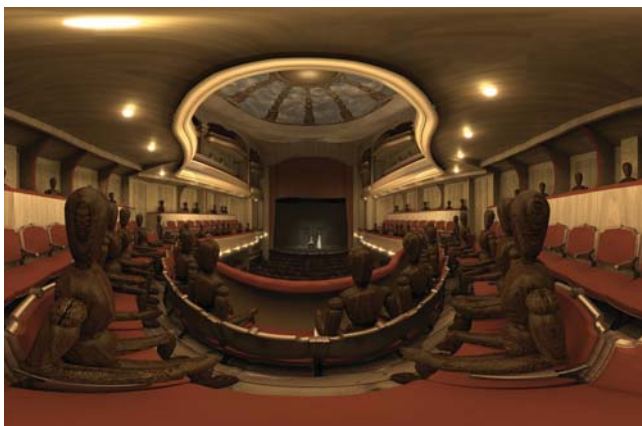
FIGURE 4. AN EQUIRECTANGULAR IMAGE taken from a simulation of a performance at the Théâtre de l'Athénée in Paris. An audience is represented visually by animated mannequins and aurally by audio samples of spatially distinct intermittent coughing, which provide a sense of an occupied theater. Such 360° images can be rendered in a head-mounted display or shown on an immersive projection screen. (Adapted from the ECHO project: http://www.lam.jussieu.fr/Projets/CloudTheatre ; rendering by David Poirier-Quinot.)

more accurate, such methods are too expensive computationally to offer a complete solution. Computer programs can take hours or weeks to reach final results across the full audio bandwidth for a large complex space. Hence, hybrid methods that combine geometric-acoustic, wave-based, and other statistical approaches are also an area of current research. 7