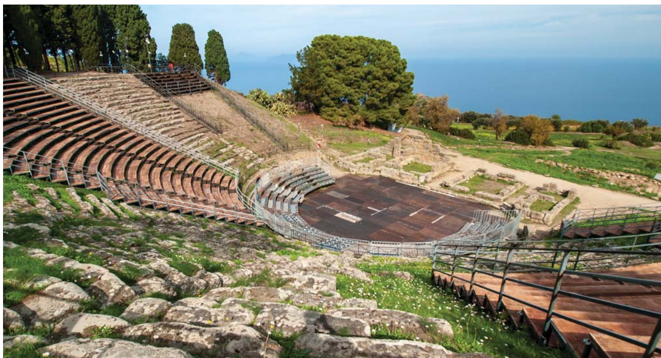
FIGURE 1. THE CLASSICAL GREEK AMPHITHEATER of Tindari in Sicily, Italy. Renowned for its acoustics, it allowed vocal sounds to be heard to the last row, 60 meters from the stage.

speech to remain understandable. 1 Whereas an ordinary living room may reverberate for a fraction of a second, a concert hall's reverberation time is typically around two seconds, and a cathedral's can exceed six seconds.