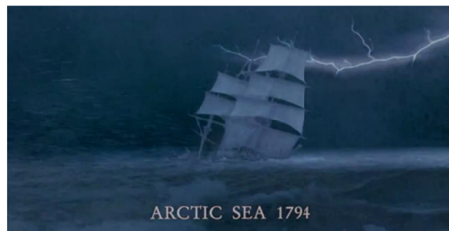
Figure 3. Standstill: storm at sea (00:01:37)

Moreover, as anticipated above, the opening scene of the film, while not reproducing the initial letters, contextualizes Victor's tale by representing—contrary to other cinematographic versions of Shelley's novel—the character of Walton on screen. After some running titles, which introduce the explorer to the viewer, the film reproduces part of his journey to the North Pole. In these initial passages, the weather and its (visual) language play a major role, and the way they are exploited marks a drastic change in relation to the original source text. Indeed, whereas the novel does not give a detailed description of the weather conditions, and the reader does not get the feeling that Walton's crew encountered such tremendous storms, the film (because of both its audio-visual nature and because of the choices made by screenwriter and director) is much more graphic and vivid.