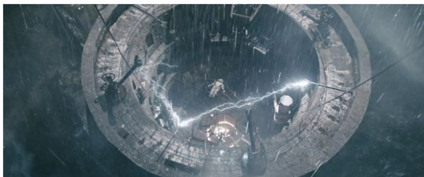
Figure 6. Standstill: McGuigan's creature