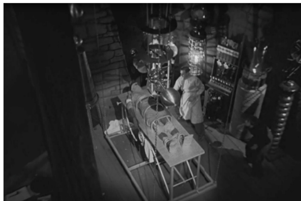
Figure 1. Standstill: Victor and Fritz in the lab (00:23:39)

It is also this film which established the physical appearance of the creature, which was to be iterated and intertextually exploited for many decades, and that would remain constant in virtually all the films from the 1930s to the 1990s (Note 2). In this case too, then, the figurative isotopy introduced by this film was exploited on many occasions, including more popular products aimed at the masses such as television series (Note 3) and comics (Note 4). The responsibility this film has had in creating and perpetuating the myth of Frankenstein therefore appears huge. Consequently, the fact that it should set the tone for the representation of many other elements connected to the original text, does not come as a surprise. Indeed, most of the scenes that represent on screen the moment when Frankenstein gives life to his creature are inspired by this first visual description, which thus provides future directors/translators with the central episode of their works. In the famous scene that portrays Victor in his lab, the spectator is actually confronted for the first time with a visual representation of the reanimation process in which the weather plays a fundamental role. Through a strategy of addition, for the first time the scientist lays down and straps the creature to the platform which is then raised in order to capture the electricity of lightning.