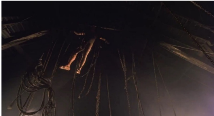
Figure 5. Standstill: the hanging

Because of this, the additions, the changes in the isotopies discussed above, as well as the conservation of some of the more canonical traits of previous translations, suggest that Branagh's target text could be more precisely defined as "partially faithful" (Swain, 1981), or, as Andrew might term it, as an "intersection" (Andrew, 1984), thus bringing to the fore questions of fidelity and faithfulness in translation.