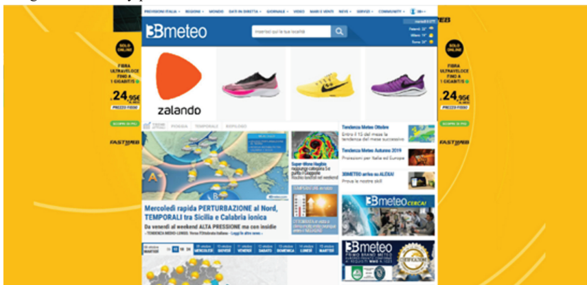
Figure 2. Visual stimulus

Imagine then to leave the site without finalize the purchase. Imagine that the day after, browsing the web, you open the website of 3BMETEO.COM, finding yourself in front of an announcement advertising that shows the exact products that you have displayed during the navigation of the day previous.”